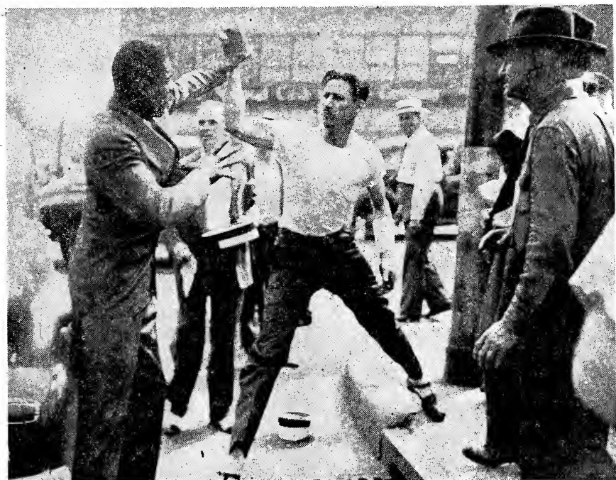
This hoodlum who also appears in the cover picture chasing a Negro with a lead pipe, is shown here attacking another Negro during the June 21-23 riots which cost 34 lives.